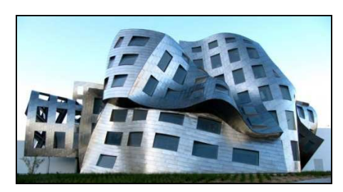
Fig. 1 The design model of Cleveland Clinic building in Las Vegas realized in 2009, designed by architect Frank Gehry.

Contemporary architecture and construction is usually defined by regular solids. Such polyhedral shapes as orthogonal, prism or pyramid can be given as examples. Also shapes defined by surfaces of second degree or quadrics belong to this category, with such examples as cylinders, cones, ellipsoids, paraboloids, hyperboloids or toruses. A modern form usually presents various versions of mutual compilation of those shapes. Attempts to break this tendency can be seen in Gaudi, Gherry or Calatrava and they were treated as extreme because of incorporation of any shapes, which can be defined as NURBS.